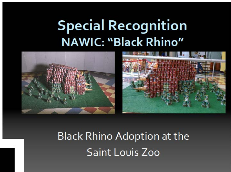
Black Rhino Adoption at the Saint Louis Zoo